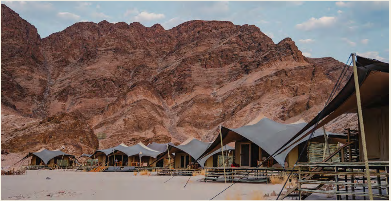
Hoanib Valley Camp: Namibia's Leading Tented Safari Camp 2024