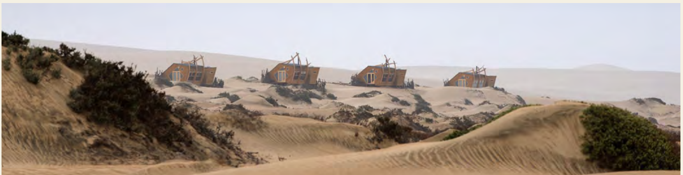
Shipwreck Lodge: Best New Safari Property