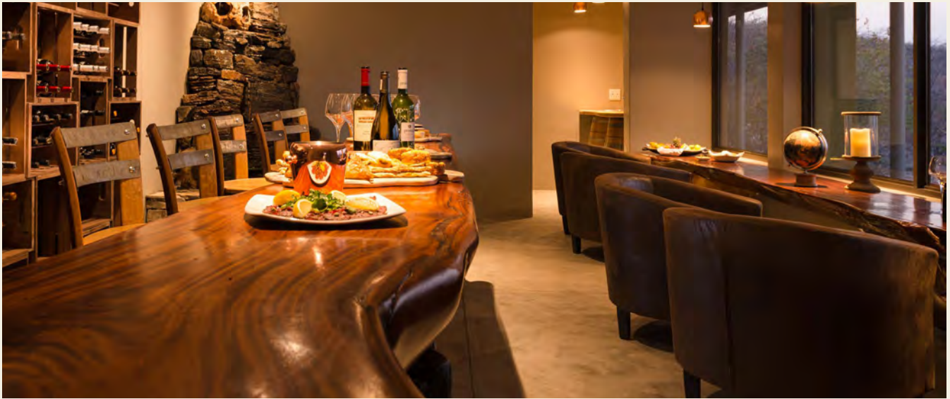
Safarihoek Lodge: Namibia's Leading Luxury Safari Lodge 2024