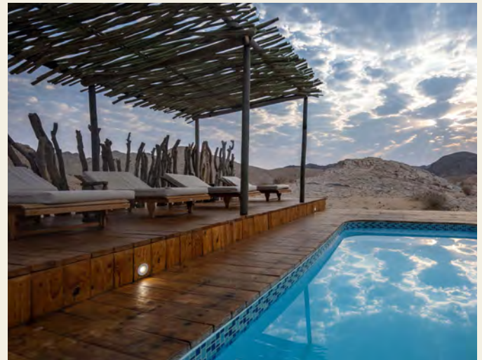
Thamo Telele: Botswana's Giraffe Retreat