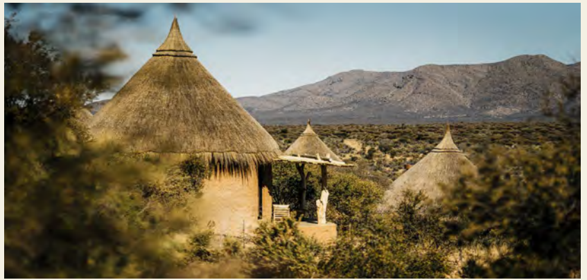
The Five Star Zannier Hotels Omaanda